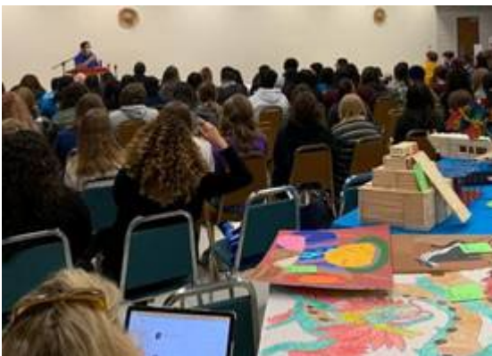
LANG FEST 2022