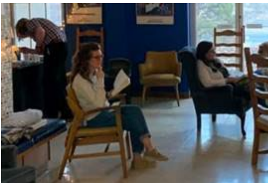
Blind Date with a Book 2022