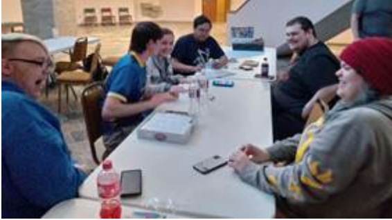
Sigma Tau Delta // Gamer's Guild Game Night 2022

"If you need wisdom, ask our generous God, and He will give it to you" (John 1:5).